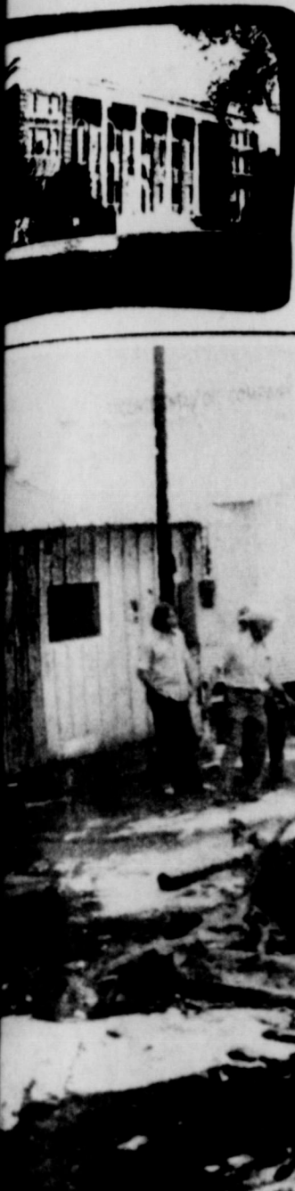
AB: This pile of rubble is all that is left of the Groendike Transport truck which exploded at the Leonard Service Station Friday evening. The first explosion blew the cab from the truck the fire burned out of control for an hour and a half. The driver of the transport was burned in the initial explosion; he was carried to Parkview Hospital by private vehicle and later moved to the High Plains Baptist Hospital in Amarillo. A faulty hose from the transport to the storage area is believed to have caused the explosion.