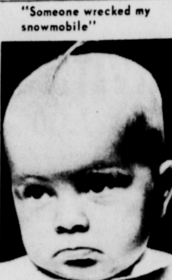
"Someone wrecked my snowmobile"