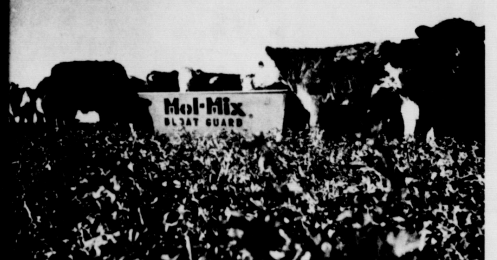
Now you can graze your cattle on lush, green alfalfa or clover with NO FEAR of bloat! How? With new MOL-MIX BLOAT GUARD!