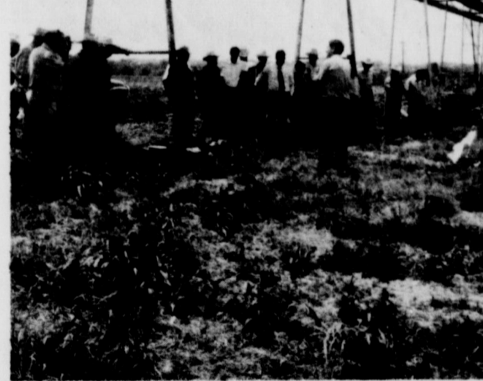
GRASSLAND FIELD DAY TOUR: A group of area farmers and ranchers gathered at the Wheeler Gin Friday afternoon for the Grassland Field Day Tour sponsored by the County Extension Service. The group was shown a demonstration plot of 16 varieties of grass. Pictured above are those present at the beginning of the tour.