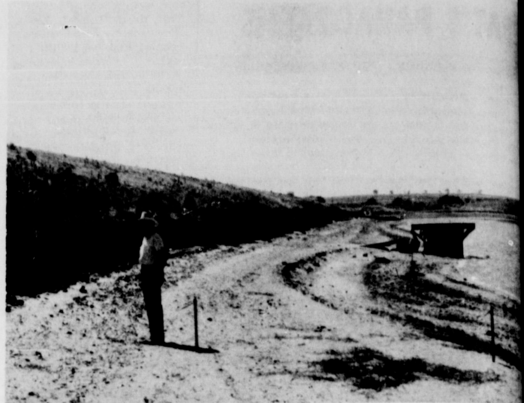
CONSERVATION NEWS: The front of this dam in the northern part of Wheeler County faced to the south. The prevailing wind caused more than usual wave action against the dam. The constant beat of the waves eventually washed away a large portion of the dam. The water had to be lowered and large rock was placed all along the front of the dam to protect it against wave erosion.