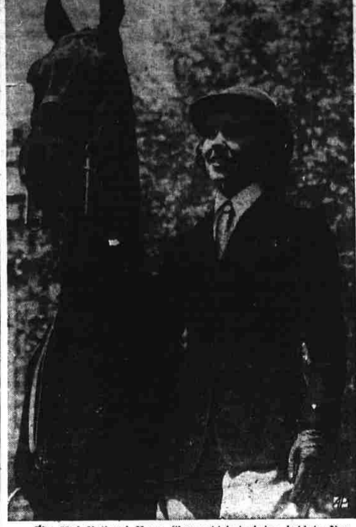
The 33rd National Horse Show which is being held in New York November 5-12, turns attention to "what's what in riding habits."