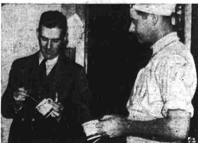
1. A District of Columbia cafe inspector swabs germ samples from the rim of a coffee mug. He also takes samples from silverware; tests dishwasher. A cafe employe watches.