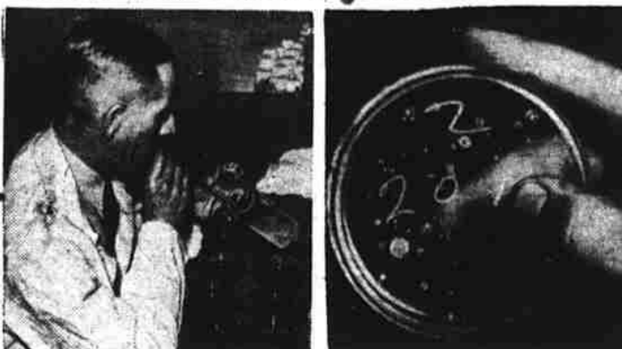
2. To the laboratory go the swabbings. An expert bacteriologist prepares to look for "bugs." Thus dishwashing goes under the microscope.