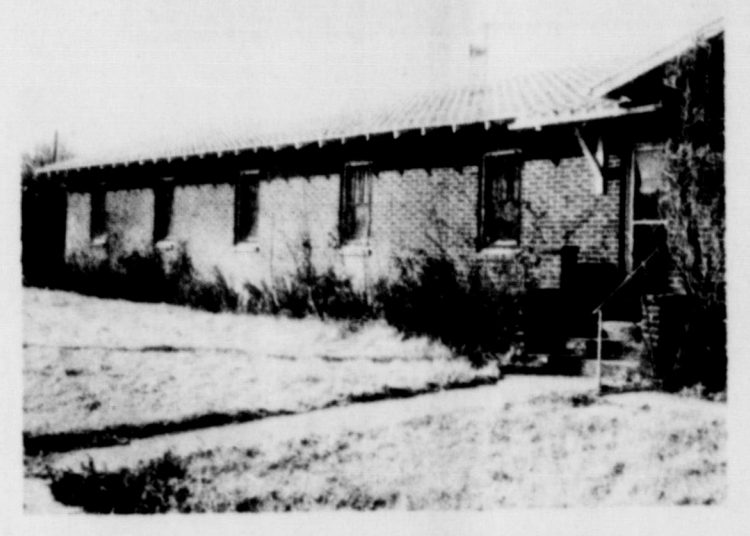
Where have we been?