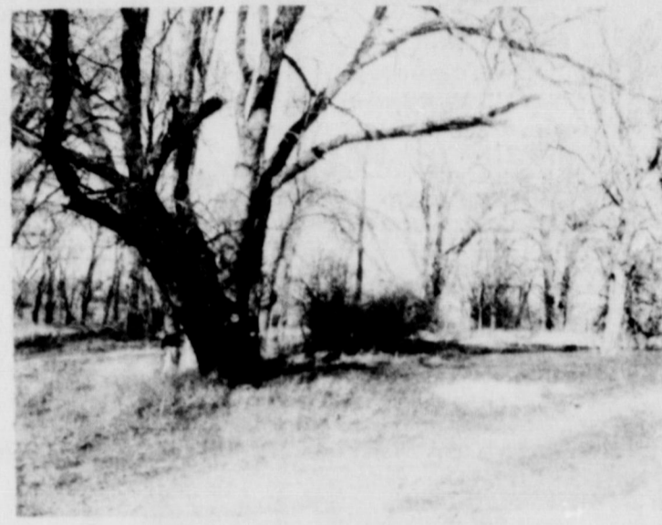
Where are we going?