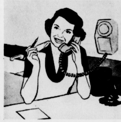
ANOTHER TELEPHONE IN THE KITCHEN