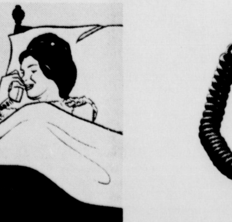
GENERAL TELEPHONE -