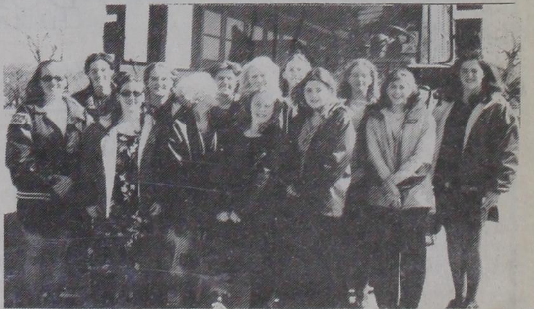
Allison Jr. High & High School Music Students