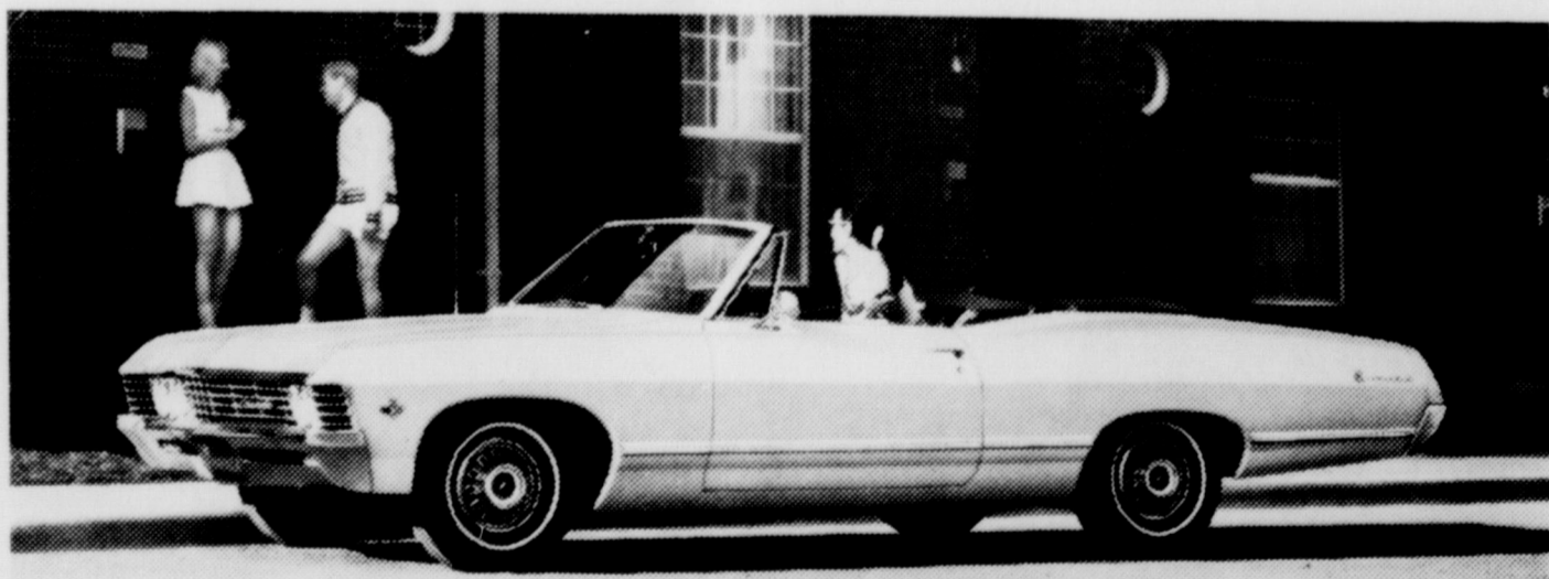
Impala Convertible—with most everything higher priced cars give you

(And that low price brings you a road-sure ride, Body by Fisher quality, and a traditionally higher resale value. You also get wider front and rear tread for greater stability and handling, foam-cushioned seats, and extra fenders inside the regular ones to help inhibit rust. Most everything more expensive cars give you!)