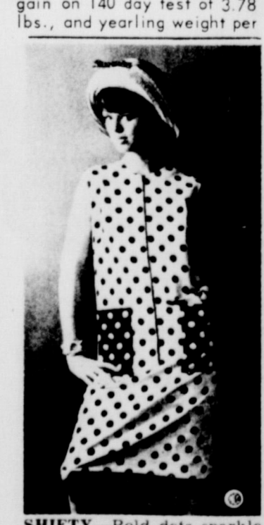
SHIFTY-Bold dots sparkle on cotton sailcloth in this slim shift with a decorative front zipper. Pleasing contrast is added in big pockets that reverse the bold dot print. By Ship 'n Shore.