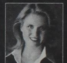
Sarah, Duchess of York Weight Watchers Lifetime Member

Check at our centers for details about our maintenance records. Registration and weigh-in begin one-half hour earlier than the meeting time. ©2000 Weight Watchers International, Inc. Owner of the WEIGHT WATCHERS trademark. All rights reserved. *Offer valid in participating areas only for a limited time. Not valid for The At Work Program or community meetings.