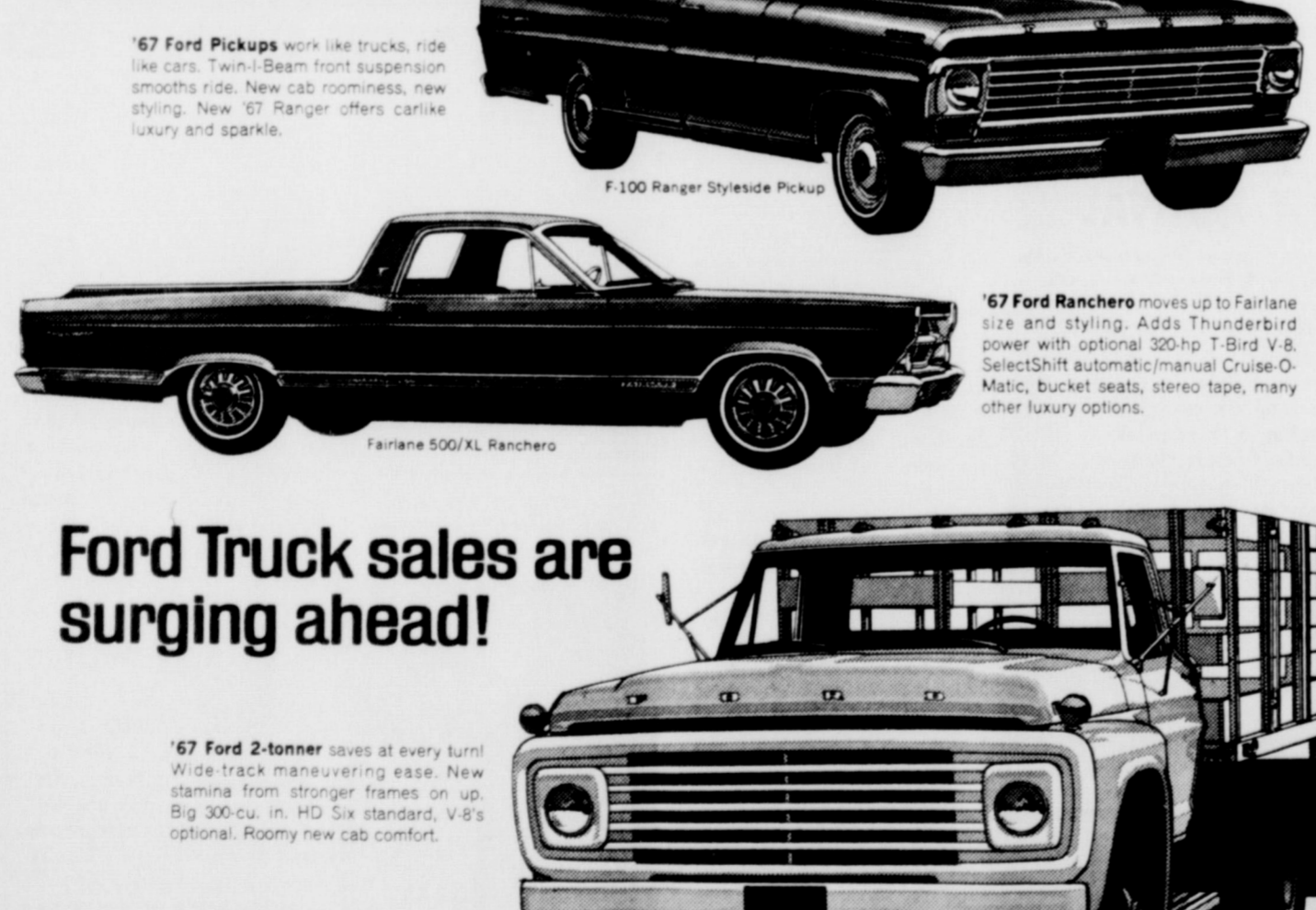
'67 Ford Pickups work like trucks, ride like cars. Twin-I-Beam front suspension smooths ride. New cab roominess, new styling. New '67 Ranger offers carlike luxury and sparkle. F-100 Ranger StyleSide Pickup Fairlane 500/XL Ranchero '67 Ford 2-tonner saves at every turn! Wide-track maneuvering ease. New stamina from stronger frames on up. Big 300-cu. in. HD Six standard, V-8's optional. Roomy new cab comfort.