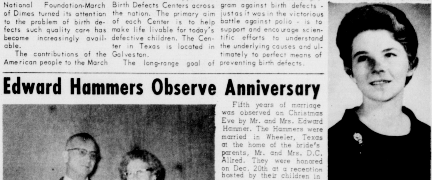
member of her community and to sameday do something that will be of benefit to other