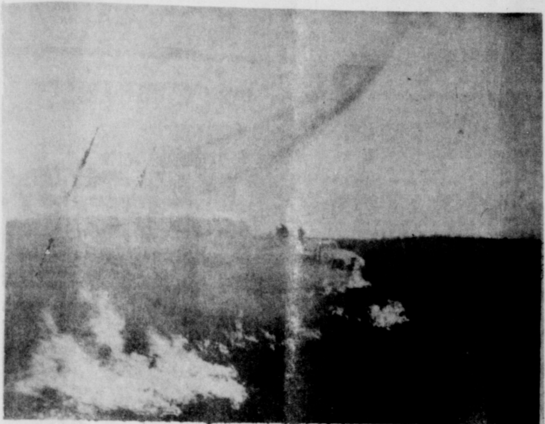
LIGHTNING STRUCK: The Wheeler Fire Department was called to Mrs. Marvin Bradstreet's place 2.5 miles North of town where lightning has set some grass land on fire. The fire only destroyed 4 or 5 acres due to the quick action of the Fire Department.