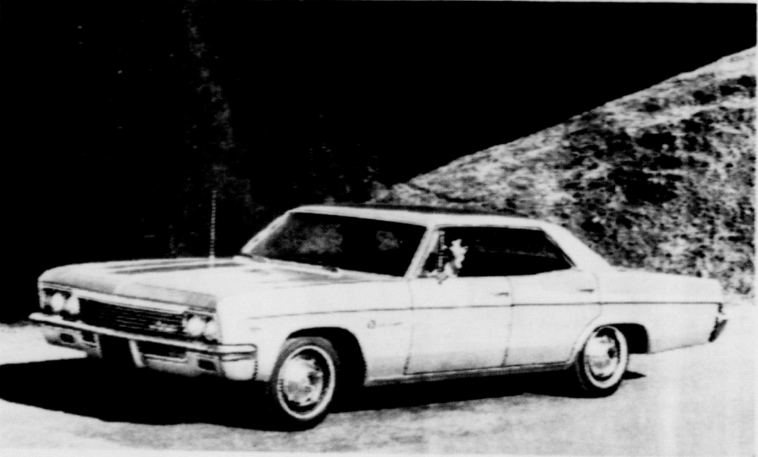
1966 Impala Sport Sedan—a more powerful, more beautiful car at a most pleasing price.

If you haven't examined a new Chevrolet since Telstar II, the twist or electric toothbrushes,