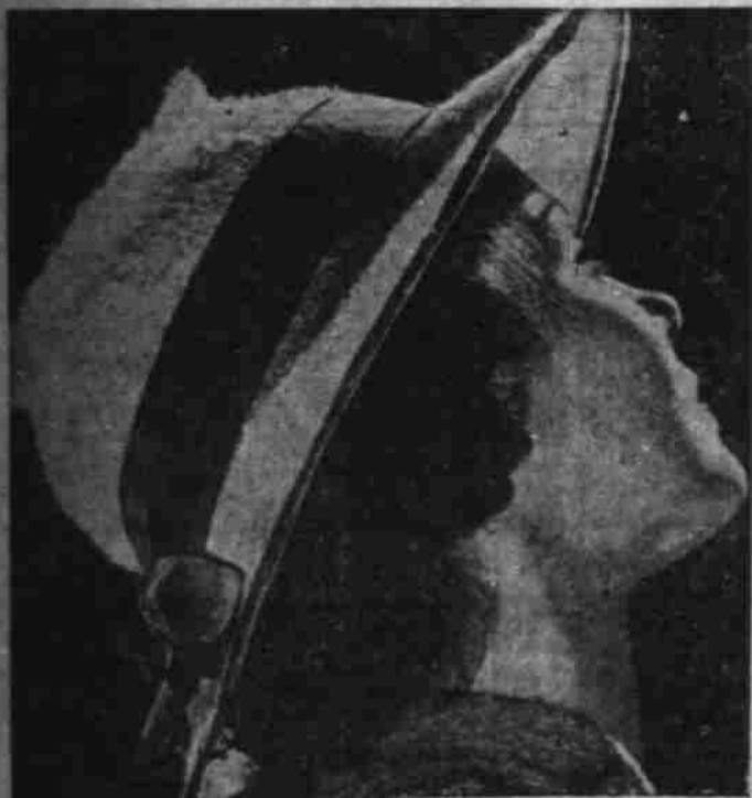
Fuzzy finished straw fabrics strike a new note.

It was up to synthetic straws to add variety to the straw hat situation, and they have done a very satisfactory job of it. Surfaces are dull or shiny, but the most exciting interest is in weaves. There are ribs, criss crosses, herringbone patterns and raised dot effects. Some synthetic straws are smooth finish and others are very rough — but they all have a tendency to look looking fabrics in the same sense of looking woven and because they are so supple. This suppleness makes them adaptable to draping and all sorts of intricate detail. The result is, that the synthetic straw hat has a great deal in its favor as a change from bako, ballibunti and toys. As an "extra" hat, synthetic straws furnish a wide choice to pep up your hat wardrobe as something different. Don't confuse synthetic straws with those brittle cellophanes that we endured some time ago. There's no danger of your new bonnet "cracking up" on its first outing if it is one of the new synthetics. They'll stand any amount of tugging and crushing without showing any wear or tear.