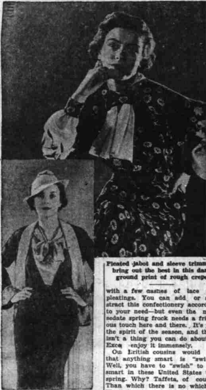
Pleated jabot and sleeve trimming bring out the best in this dark ground print of rough crepe

with a few casnes of lace and pleatings. You can add or subtract this confectionery according to your need—but even the most sedate spring frock needs a frivolous touch here and there. It's just the spirit of the season, and there isn't a thing you can do about it. Except enjoy it immensely.