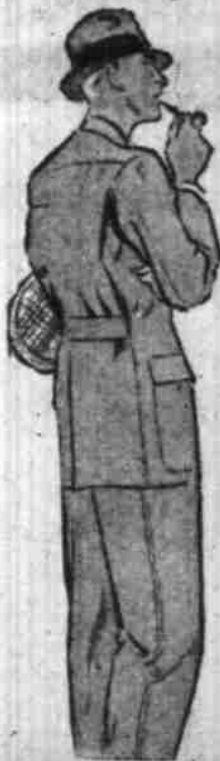
Regular, Slims Shorts and Stout

loss, fire hazards, etc., which oil producers have contended with since practically the beginning of the industry. The present 'rule of thumb' method in use in bleeding off water with its attendant losses of oil and gas and imperfect elimination of water, led the writer to study this matter and this led to the application of the hydrostatic principle which is simply a balance of the two fluids in proportion to their specific gravity—a simple mathematical problem combines in the Edwards Hydrostatic Bleeder with a trap to prevent loss of gas. This device is easily and readily installed in the tanks of the producer and is not a water separator, but is an automatic water bleeder which allows the water to settle out thoroughly, conserves gas and gravity of oil, and is absolutely automatic, requiring no attention whatever. Its use insures the operator prac-