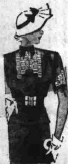
Distinctive 3-piece Ellen Kaye frock of Spring Green with brown lace trimming at neck and sleeves. Corded collar and cuffs.

Complete Line Of Spring Fashions Now Featured for Your Approval