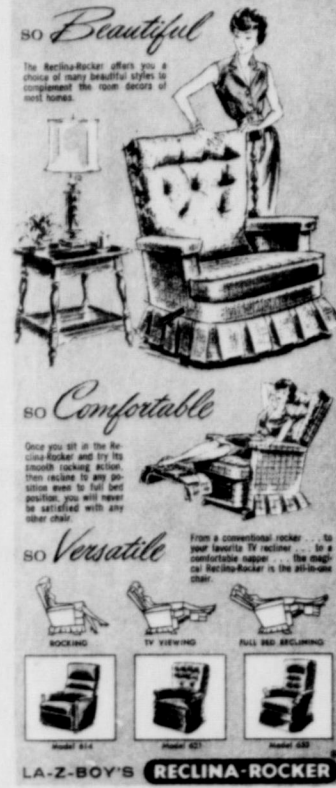
LEE HARDWARE & FURNITURE PHONE 3331

the survey, the soil characteristics such as depth, texture, permeability, structure and color are studied. Soil descriptions are written of these soils and the ones that have like characteristics are grouped together. Soils that have unlike characteristics such as greater erosion hazards, different crop adaptation, different production potential, and other unlike qualities are separated. Soil samples are to be taken in some areas for laboratory studies. The areas of different kinds of soil are located on an aerial photograph. "The chief use of the soil survey is to assist farmers and ranchers in the Wheeler County Soil Conservation District in planning and carrying out their soil and water conservation plans", said Brooks. Contractors of all types of construction work are making use of soil survey information. When the survey is completed, the aerial photographs on which the information is recorded will be made into a map. The map will be published with a report describing the soils and uses for them. The soil survey report will contain more