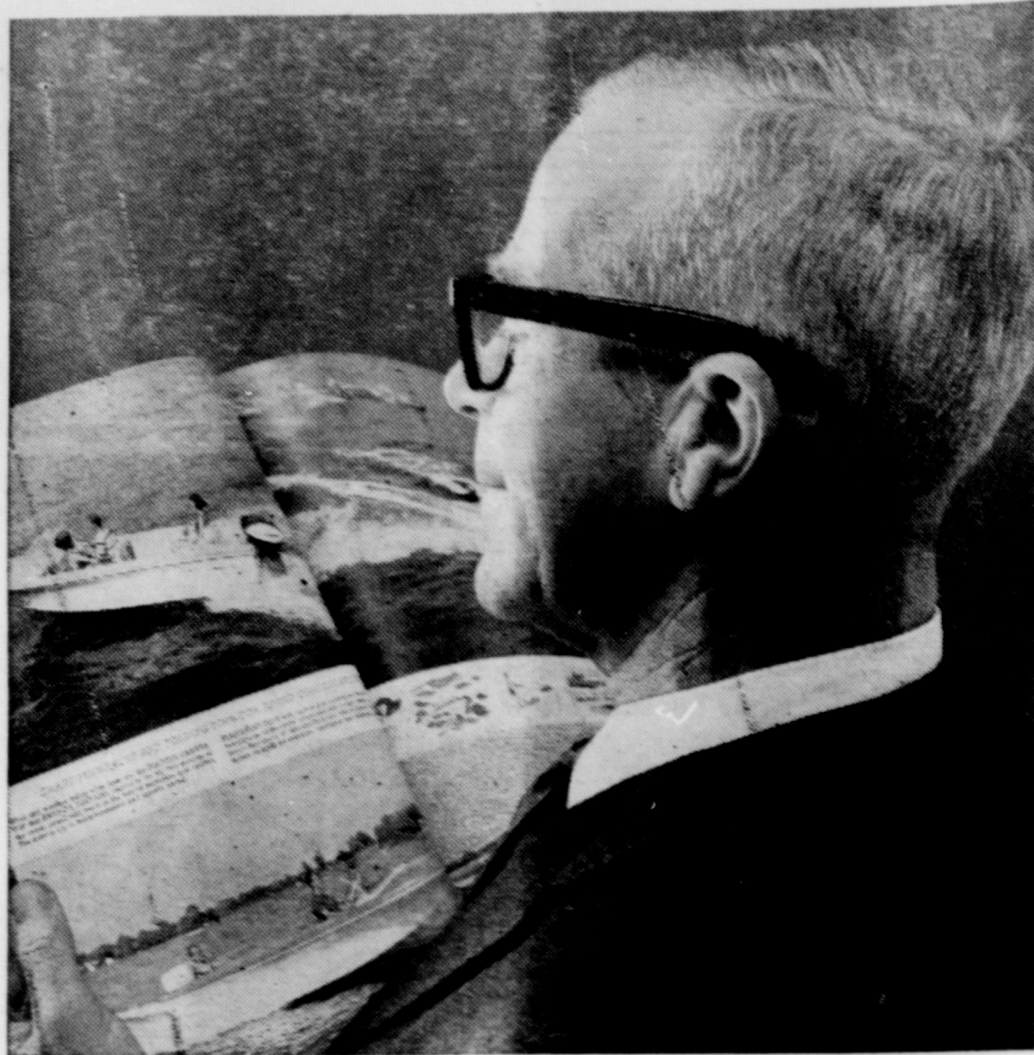
Don't you read before you buy?

Most people generally do. Not only do they read; they cut out and send ads to their family and friends; they clip coupons for information and samples. When people see an advertisement in print, they can compare designs . . . features . . . and prices of nationally known products and services. (And people do compare before they buy.) Advertising in print is a handy thing. You