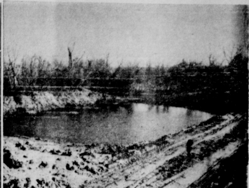
SEEP TYPE POND: This is a picture of a seep type pond on the T. J. Cole farm about 5 miles southeast of Wheeler. This particular pond is 60 feet wide, 100 feet long, and 10 feet deep. It was installed under the Great Plains Conservation Program. As you can see it is standing full of water. This is an excellent source of stock water and is good for fishing. This type of pond can usually be built in an area where the water level is within four feet of top of the ground. Many farmers and ranchers in the Wheeler Soil Conservation District are fortunate in having seep areas on their places on which a pond of this type can be built. About fifteen have been built within the last year in the district.

vestigate the possibility of this insect becoming an established cotton pest above the Caprock. FHA county supervisors, under the direction of L. J. Cappelman, State Director enlisted the aid of several borrowers in each county in planting a few rows of early cotton. Upon emerging from hibernation in areas where overwintering has occurred, weevils will normally move into older plantings. This "trap crop" provides a suitable area for observation by the survey teams. Over plantings of early cotton in each county are also being inspected for overwintering weevils. Early cotton in 20 counties in the Red Rolling Plains and along the eastern edge of the Caprock were surveyed for overwintered weevils during the week of May 21. Weevils were found in only four counties during the week—Stone, Wall, Jones, Haskell and Fisher counties. Apparently, weather and other conditions have not been favorable for emergence in other counties to date. Teas A&M College entomologist and county agricultural workers will continue to closely watch the boll weevil situation during 1963. Special efforts will be made in counties along the Caprock to locate over wintering areas and to determine if weevils have survived the winter above the Caprock. The "trap crop" system has also been set up in Wheeler County, but to my knowledge no plots are up to check due to the prolog drought. When we receive ample moisture then these selected plots should be of assistance to us in boll weevil.