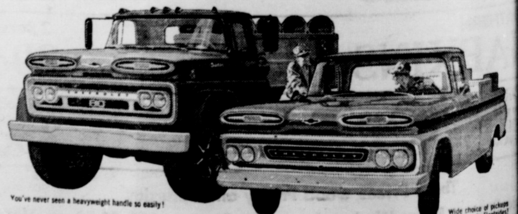
You've never seen a heavyweight handle so easily!