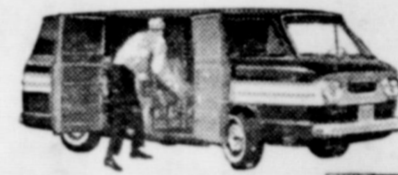
CORVAN—Side doors open a full 49" wide. Loading height is a low 14" lift!