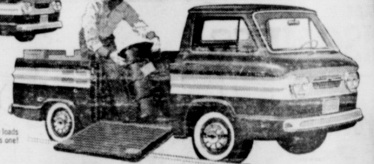
RAMPDOE—Roll out the heavy loads—nothing to it in this unit!