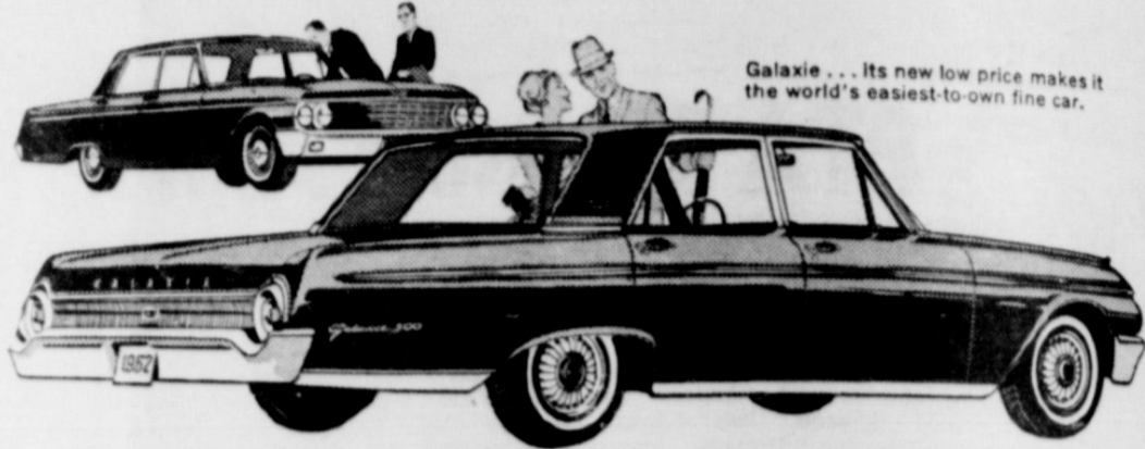
Galaxie... Its new low price makes it the world's easiest-to-own fine car.

No other luxury sedan can equal the sheer zest of Galaxie's optional 390 Thunderbird V-8! Not one can hold a candle to that lean, clean Thunderbird roofline! And Galaxie for '62 introduces twice-a-year maintenance... cuts routine service down to every 6,000 miles! So why pay hundreds more when you can ride in pride at our new low Galaxie price?