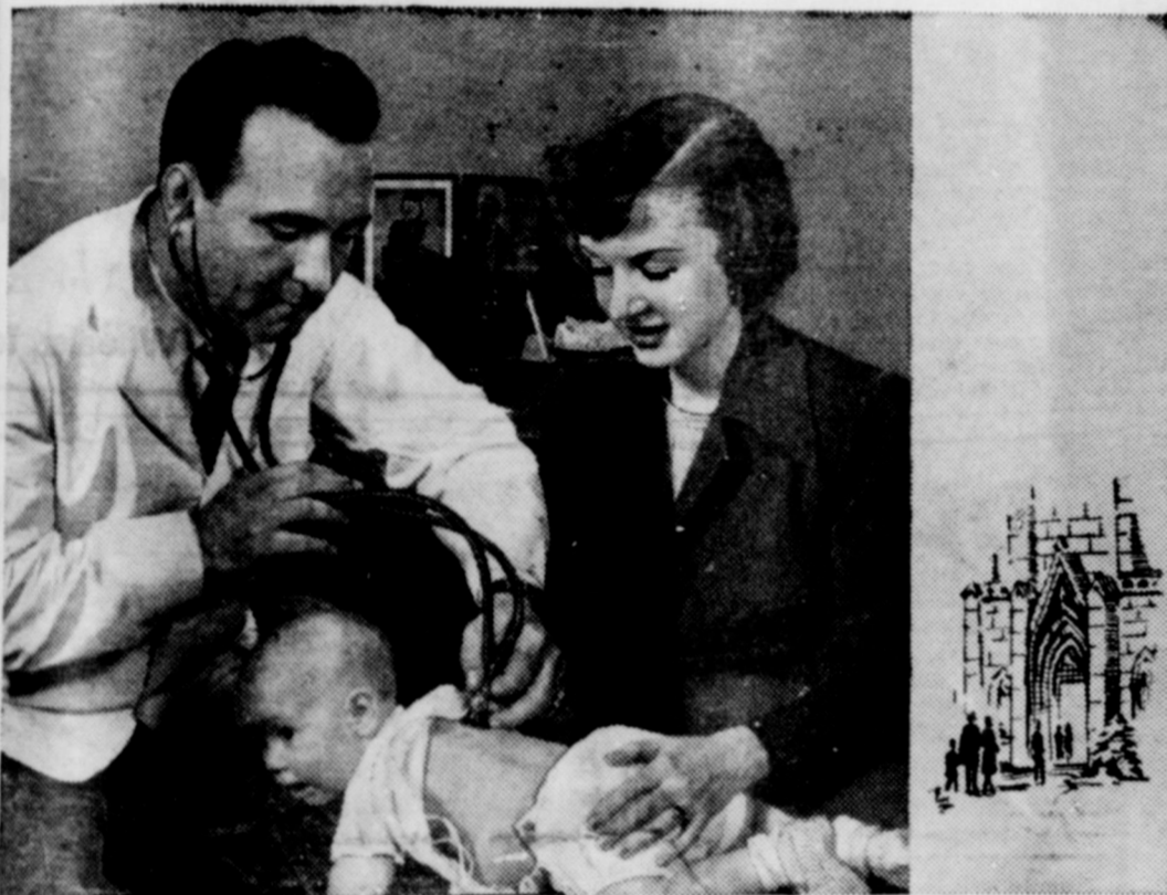
She'll Never Neglect Him...