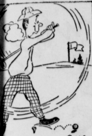
Fore! Er...that is 3/2

Parents, keep a close contact with your children's progress. Help us to help them to do their very best.