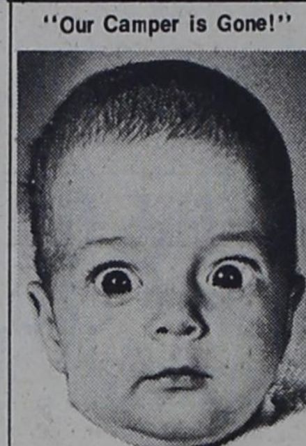
The thief rolled his car with bumper hitch up to their camper and drove off. This has been done with boat trailers as well. Insurance to cover theft or accidental damage to all types of camping or boating equipment is available from Rives Insurance Agency.