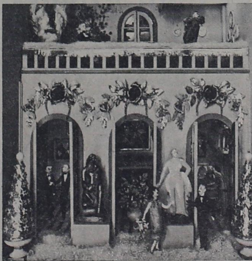
STETTHEIMER DOLL HOUSE decorated for 1920's Christmas. Friends in and around the art gallery include Gaston Lachaise chatting with painter Marcel Duchamp, writer Henry McBride greeting Florine Stettheimer, Edward Steichen on the balcony photographing Elizabeth Duncan.

a diminutive world not unlike the one in which she lived . . . one of embroidered bed sheets, bedrooms lined in chintz, luxurious draperies, crystal chandeliers.