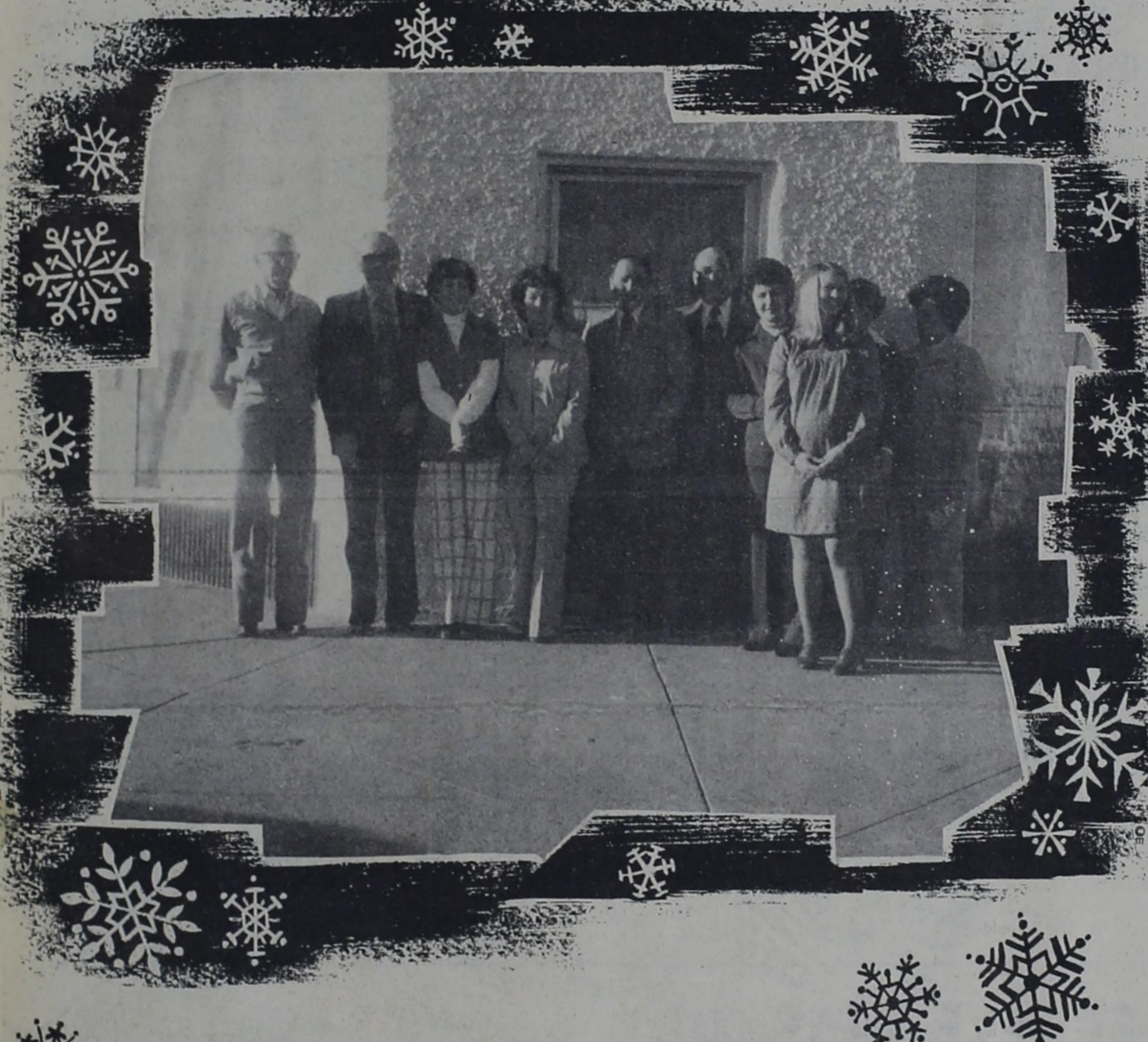
Closed Christmas Eve