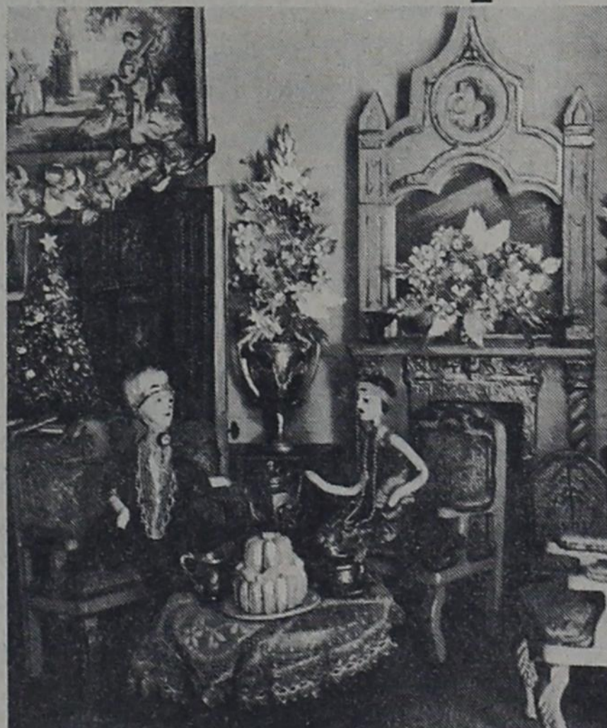
STETTHEIMER DOLL HOUSE decorated for Christmas. Mother and daughter at tea in the living room.