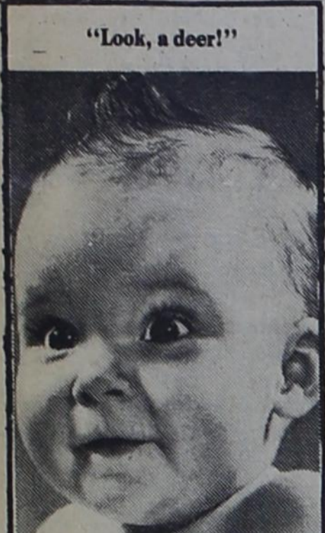
"Look, a deer!" Everyone looked, the car ran off the road and hit a tree. That's why auto liability, property damage and medical payments insurance is available from Rives Insurance Agency. Oh yes, also towing and emergency road service coverage.