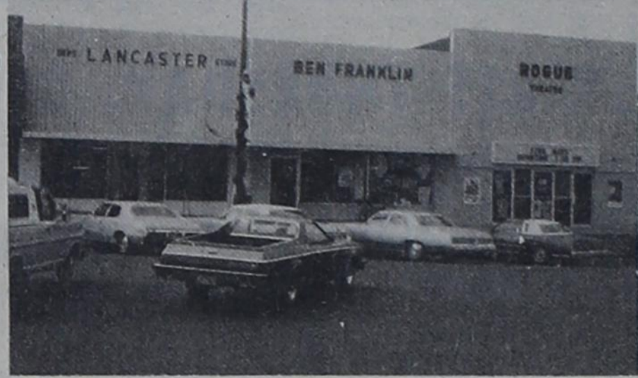
Rogue Theatre, Lancaster's and Ben Franklin

As you can see, Wheeler continues to grow and prosper. We hope we haven't failed to mention anyone; if we have, let us know.