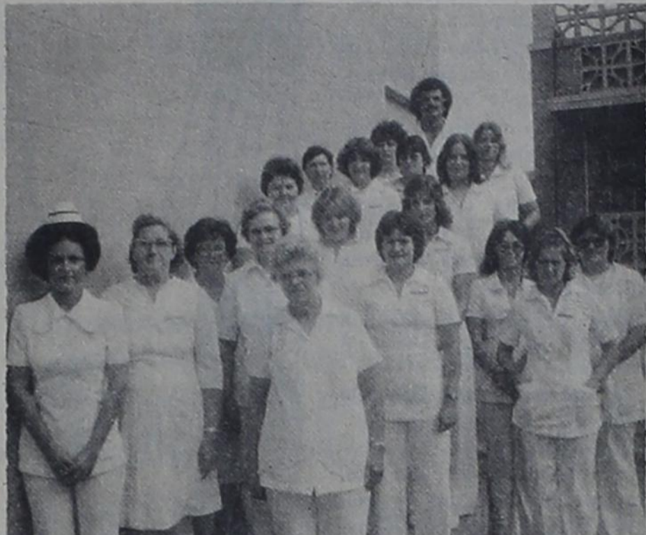
WHEELER'S FIRST CLASS: Twenty students from Wheeler