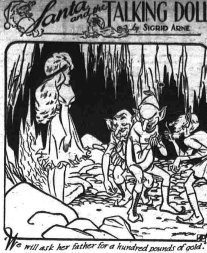
We will ask her father for a hundred pounds of gold.