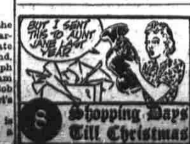
Stopping Days Till Christmas

AUSTIN, Dec. 14 (AP)—The end of statewide shutdowns of oil production probably will come in form of discussion at tomorrow's hearing on January prorations of more than 90,000 Texas wells.