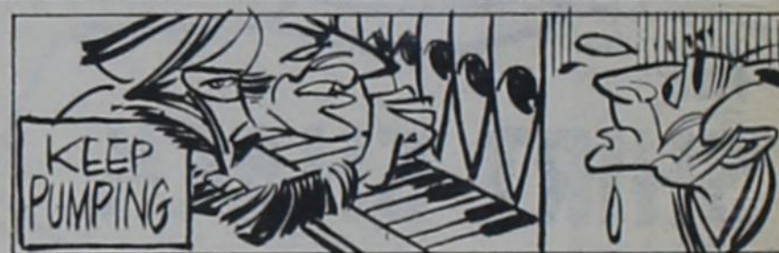
Seventy men were once needed to pump the bellows of a huge 10th century organ in Winchester Cathedral, England.

The vows will be exchanged March 7 in the First Baptist Church in Shamrock at 8 o'clock P.M.