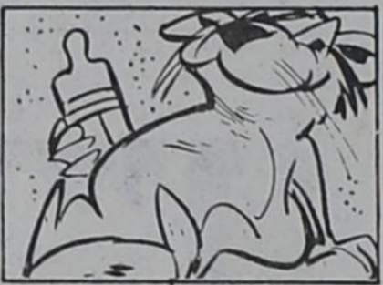
Baby opossums multiply their birth weight ten times in the first week of life.