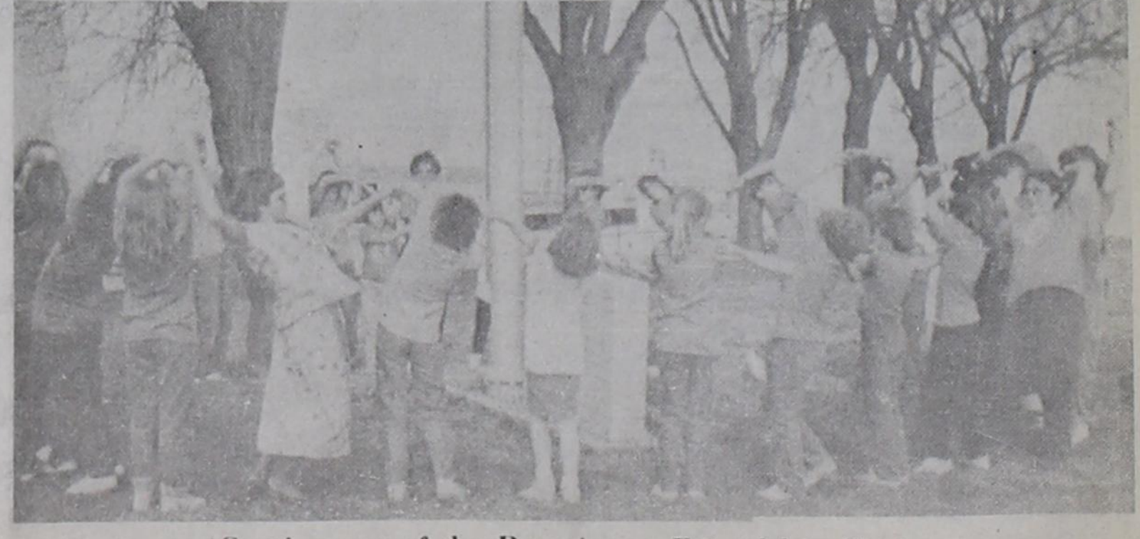
Coming out of the Promise or Friendship Circle