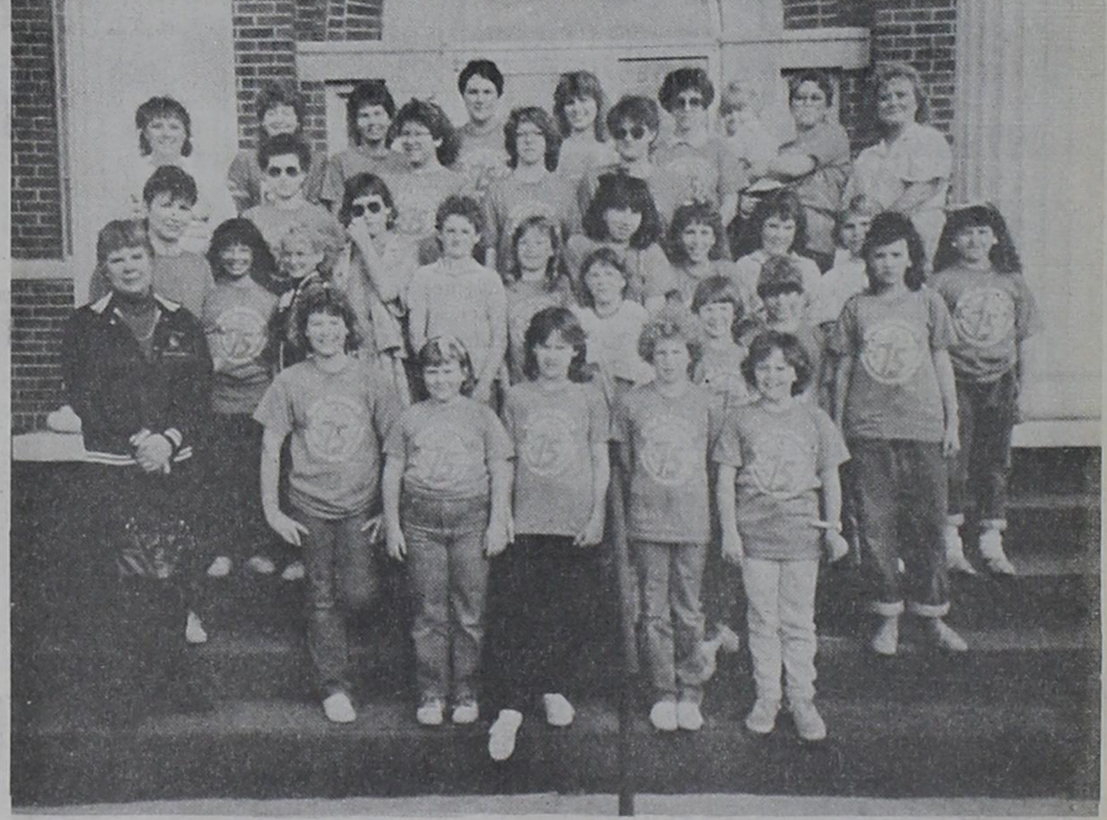
Wheeler Girl Scouts and Their Leaders

Girl Scouts have set a challenge for us to follow. Their example of service and concern for others is unmatched. They have shared themselves and their skills with our community in the hope of creating a better future for all. Thank you, Girl Scouts. You have established yourselves as strong role models of good citizenship. Happy 75th anniversary!