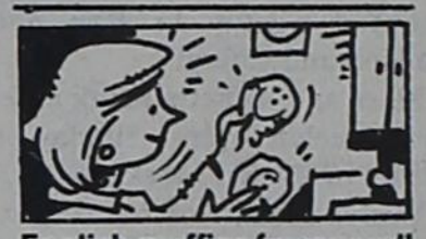
English muffins freeze well but separate the halves before freezing for easier toasting.