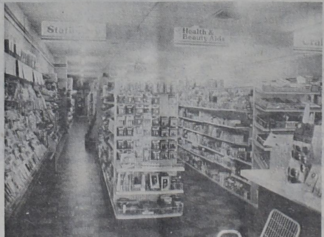
BEN FRANKLIN: Have you been in the local Ben Franklin Store recently? The store has been "reset" and is well stocked. They offer a good supply of school and office supplies, health and

Thanks to the 1984-85 officers for a tremendous job. HELP SUPPORT OUR BAND—Attend Band Booster Meetings: 2nd Tuesday of each month in the Band Room, W.H.S.