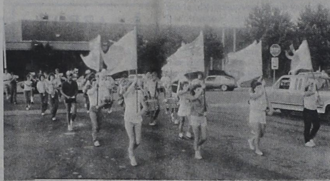
BAND PRACTICE: The Wheeler Mustang Band, 43 members strong, was on the street this week working on their marching and playing. The number is expected to increase with enrolment.