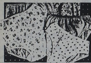
Girls' panties in solid colors or prints. Polyester-cotton. Briefs in sizes 2-12.