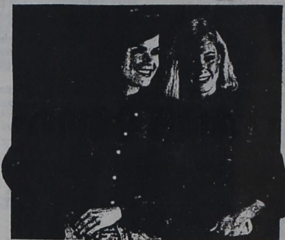
Blouses in bright plaids in polyester-cotton Sizes 5 - 15, XS-S-M-L.