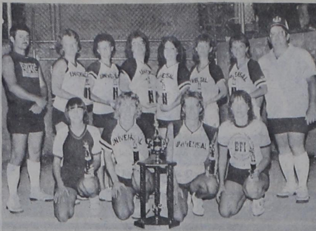
SECOND PLACE: Universal softball team takes 2nd place in the 1985 Wheeler Women's League, (back row,