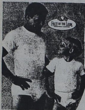
FRUIT OF THE LOOM GOLDEN BLEND