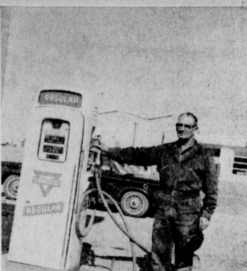
FAST CAR SERVICE — First Street Conoco Station gives fast service if your caught out with a flat, out of gas, or other road trouble.

FREE FILM You will receive a FREE ROLL of FILM for each roll of color or black and white film you bring to our store to be developed. NO SLIDES OR MOVIES PERRY'S