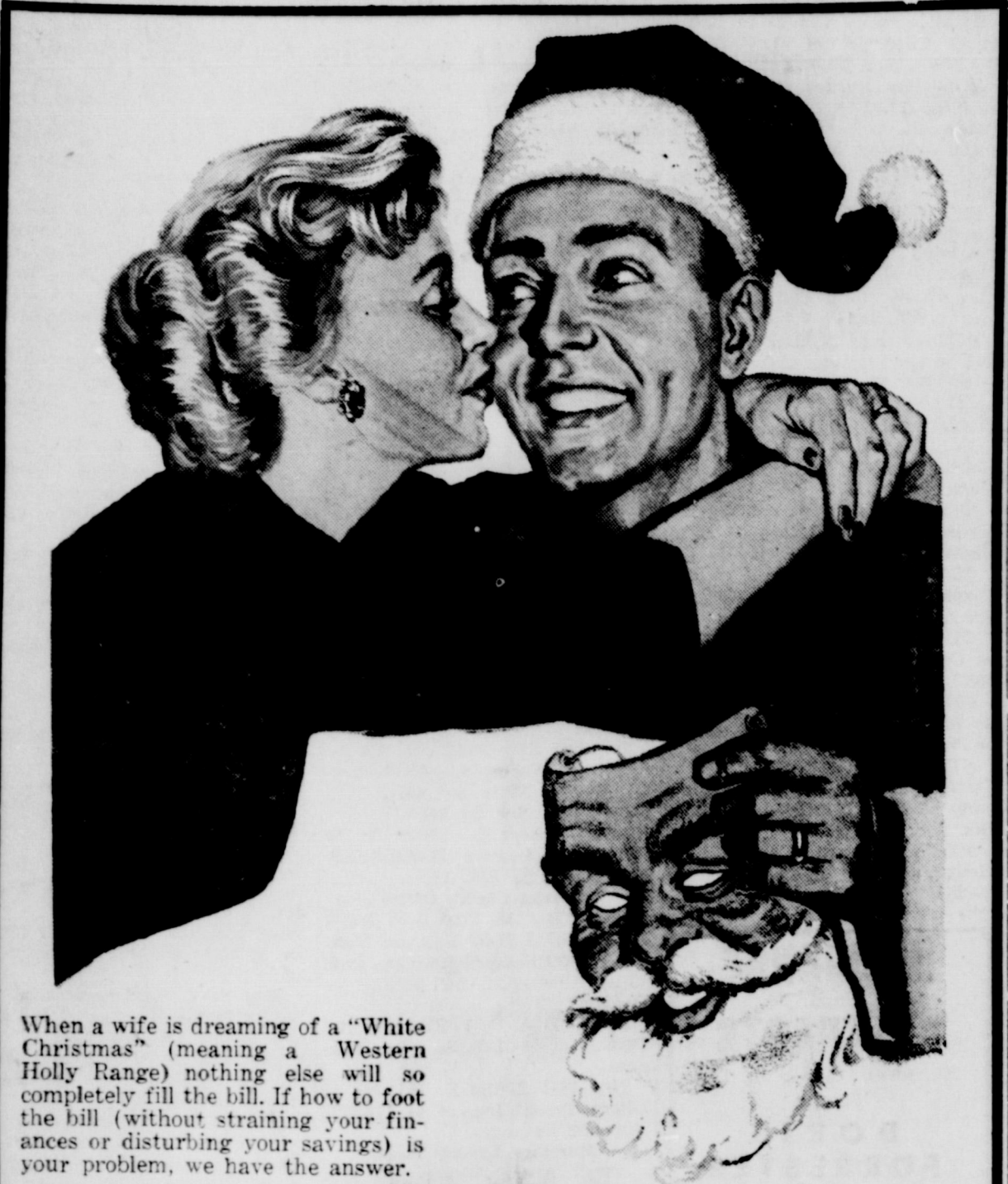
When a wife is dreaming of a "White Christmas" (meaning a Western Holly Range) nothing else will so completely fill the bill. If how to foot the bill (without straining your finances or disturbing your savings) is your problem, we have the answer.