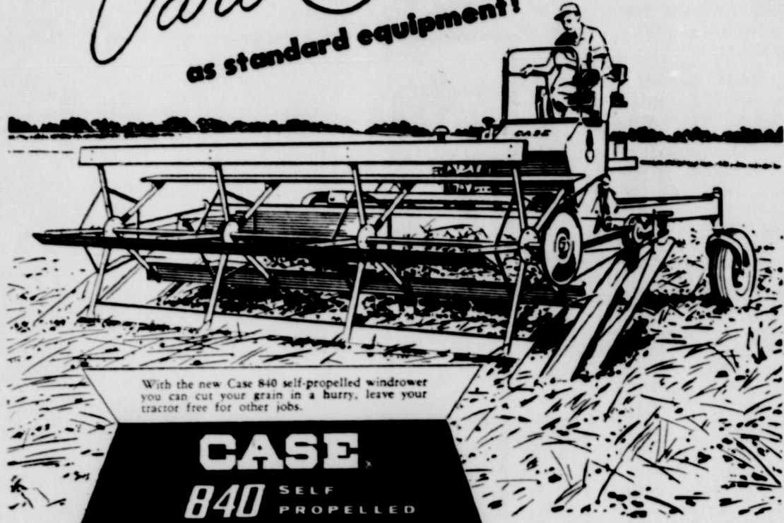
With the new Case 840 self-propelled windrower you can cut your grain in a hurry, leave your tractor free for other jobs.

the Only windrower with effortless Vari-Steering as standard equipment!