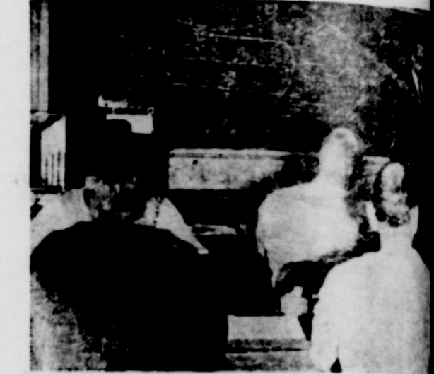
MOST FREQUENTLY taught of all non-military defense is Radiological Monitoring for instructors. It is designed technically-qualified adults how to instruct others in the measure radioactive fallout which would be spread by a nuclear attack. The training course is stressed because most other fields, the radiological expert has few uses in ordinary civilian life who could be called upon in an emergency. Classes are taught at the Western Instructor Training Center at Alameda, Calif.; the Eastern Instructor Training Center at Brooklyn, N. Y., and the Chemical-Biological Defense School at Battle Creek, Mich.