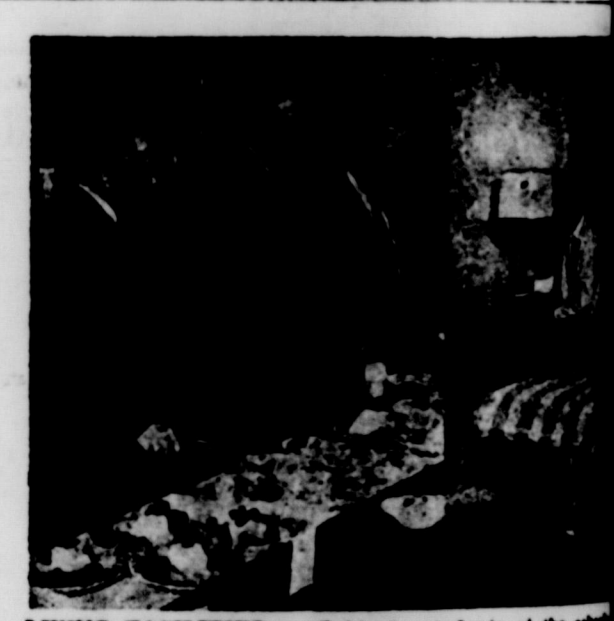
LIVING FACILITIES available to students at the Office of Civil and Defense Mobilization are comparable to schools and convenient to classroom areas. Shows on camera and a typical student room for the OCBDM Staff College. Rooms are $1.50 a night. Students attending OCBDM free courses under State sponsorship are eligible for partial reimbursement for travel and living expenses. For information write to the above schools or to the Western Instructor Training Center at Alameda, Calif., or the Eastern Instructor Training Center at Brooklyn, N. Y., respectively.