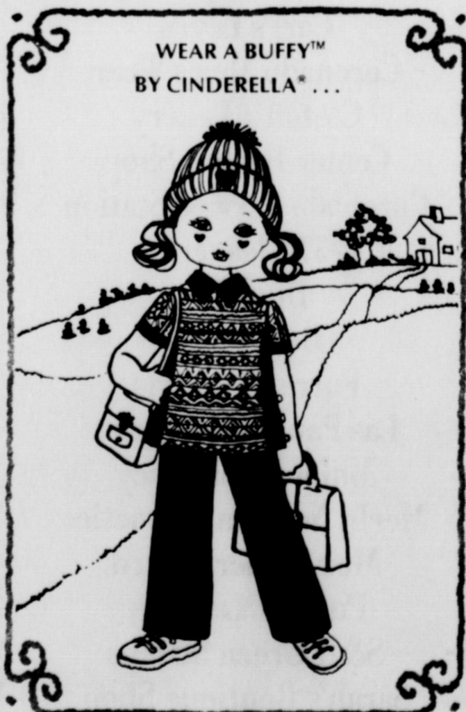
WEAR A BUFFY™ BY CINDERELLA® ...

... Buffy goes back to school in style and your little girl can go right along with her in Cinderella's multi-colored Scandinavian inspired tunic trimmed in contrast navy (100% bonded Acrylic) worn over navy flared pants (100% bonded Orlon® acrylic).