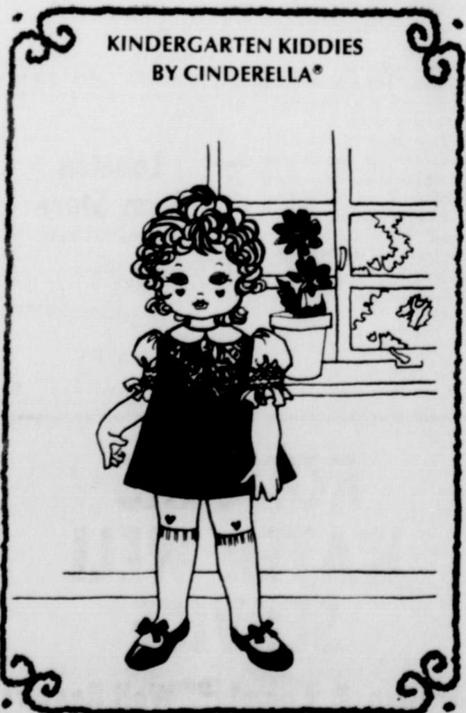
KINDERGARTEN KIDDIES BY CINDERELLA®

... She'll be the hit of the sandbox set in Cinderella's® purple A-shape jumper with its' own white smocked sleeves and collar. 50% Fortrel® polyester/50% cotton, it's from the "STOP THE PRESS"® collection which means it goes through the washer and dryer and comes out without a hint of a wrinkle. Even the pussycat bow! Mom will love that!