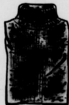
Turtleneck Weather Coming Donmoor®