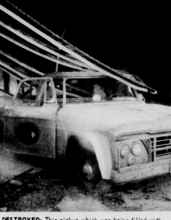
DESTROYED: This pickup which was being filled with gas at the time the blaze broke out was completely destroyed by the fire. The pickup was parked at the door of the barn, but could not be removed.

of Rt. 1, Canadian, Texas tal, Pampa, Texas. The young grandparents are Mr. and Mrs. great grandparents.