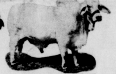
Verde Zarza Adolfo 305/7