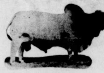
Verde Zarza Noel 18/6

The two tons of bull power will be used for cross breeding English blood lines. The steers will go into feed lots and the heifers kept for replacement cows. The Lees have fed cross bred Brahm