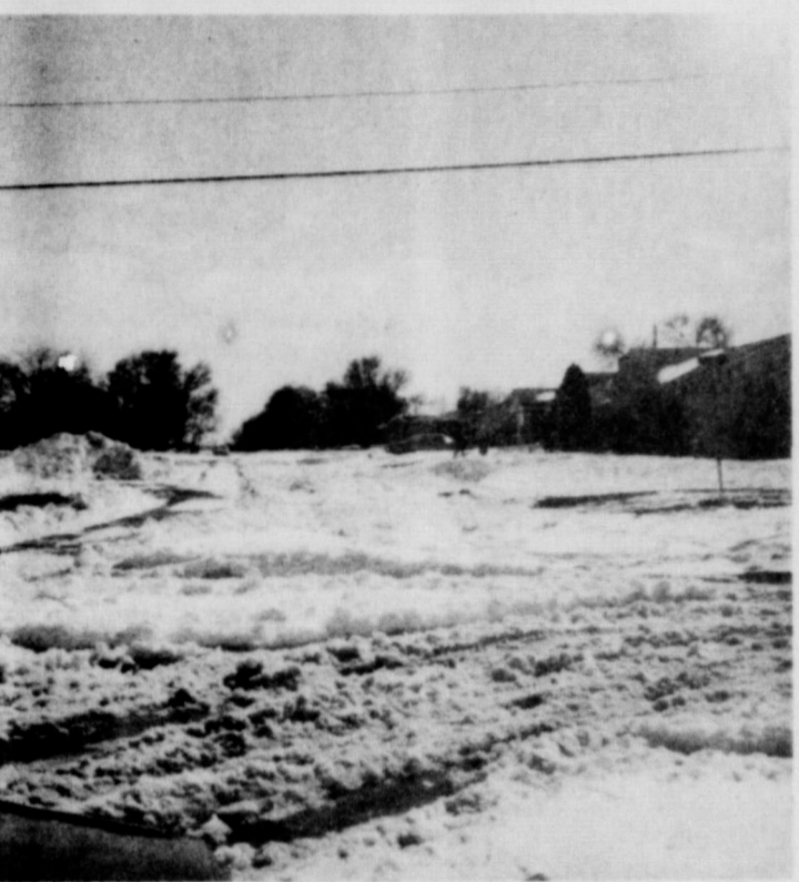
STREETS IN THE RESIDENTIAL SECTION: This picture taken of the 500 block of Commanche was very typical of most of the streets in Wheeler. The picture was taken Tuesday afternoon after traffic had picked up.