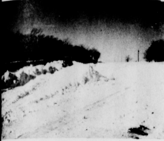
HIGHWAY 152 one mile east of Mobeetie was blocked with an 8' drift deep. The top picture taken Tuesday shows the beginning of work to clear the road. The bottom picture shows the work completed with snow piled high on either side of the road.