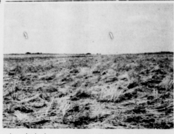
A good job of managing crop residue is pictured above on the E. O. Kelly farm. By plowing to leave stalks or residue on the soil surface erosion due to water or wind is lessened. Other benefits are reduction in moisture loss, fewer trips over the field, retarding runoff, and maintaining a cooler soil temperature during the hot summer days. The latter is important to keep from killing soil bacteria which fix nitrogen and aid in the decay of organic material.