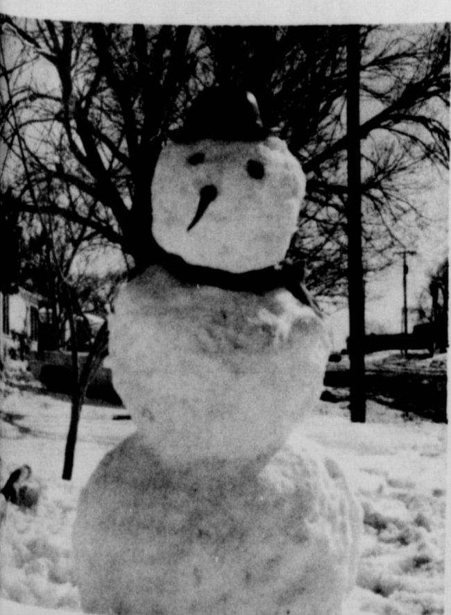
POPULAR PASTIME: This week seemed to be building snowmen such as this one in front of the Loraine Wagner home on Main Street.