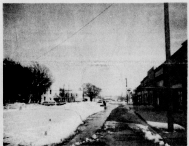
A PATH: The 100 Block of East Texas was covered with a 4-5 foot drift of snow. A path was cut on each side of the street with snow piled in the middle. This was the way it looked Tuesday afternoon.