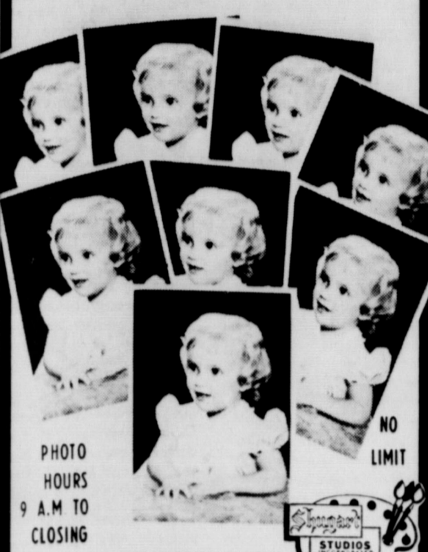
PHOTO HOURS 9 A.M. TO CLOSING

KING SIZE WALLET CREATIVE COLOR PORTRAITS FOR ONLY