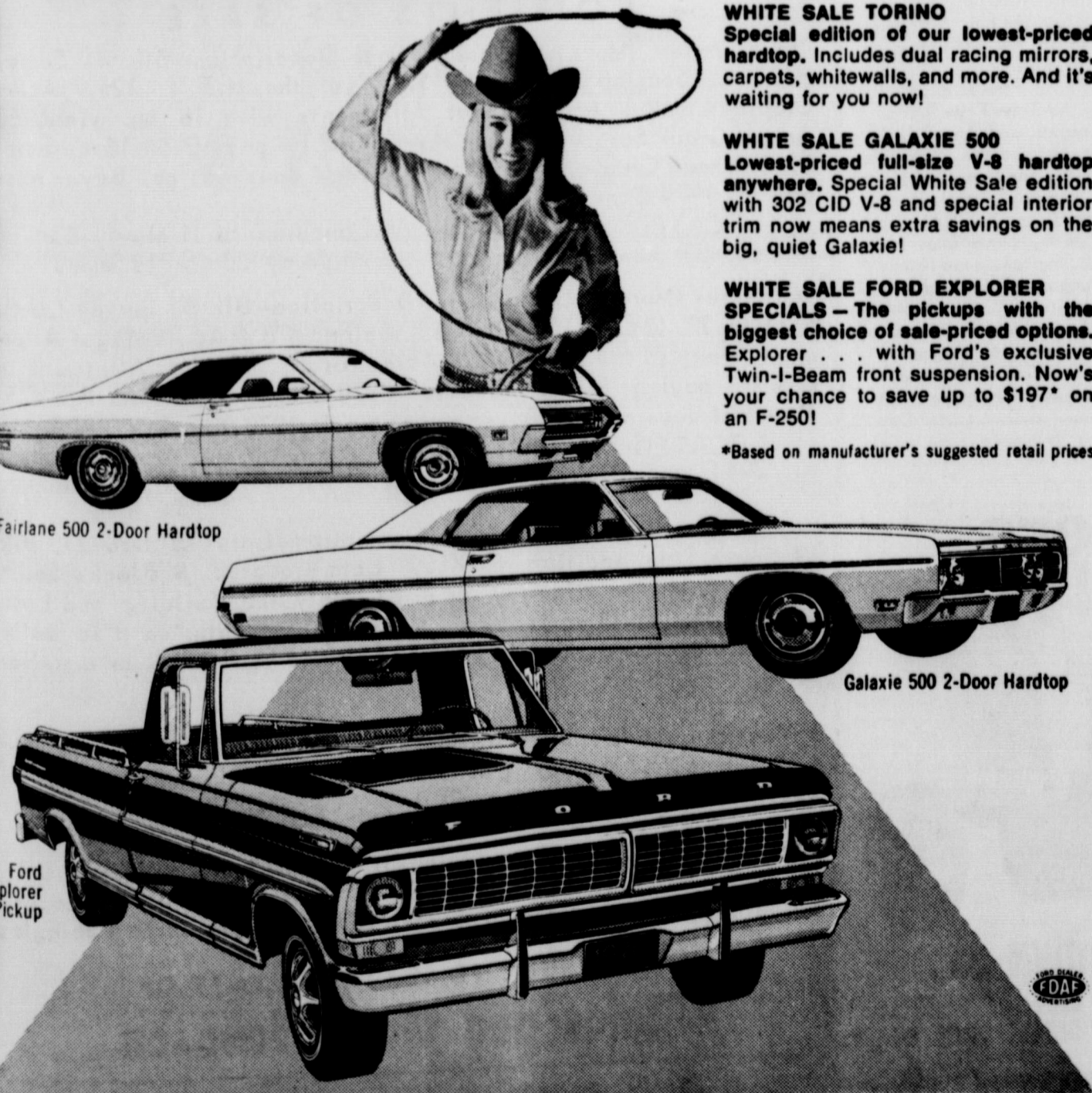
Fairlane 500 2-Door Hardtop