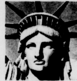
A. Little Orphan Annie. B. The Jolly Green Giantess. C. The Statue of Liberty. D. Mae West.

If you picked anything other than C, well, you're in a whole lot of trouble.