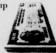
If they're lost, stolen, or destroyed, we replace 'em.