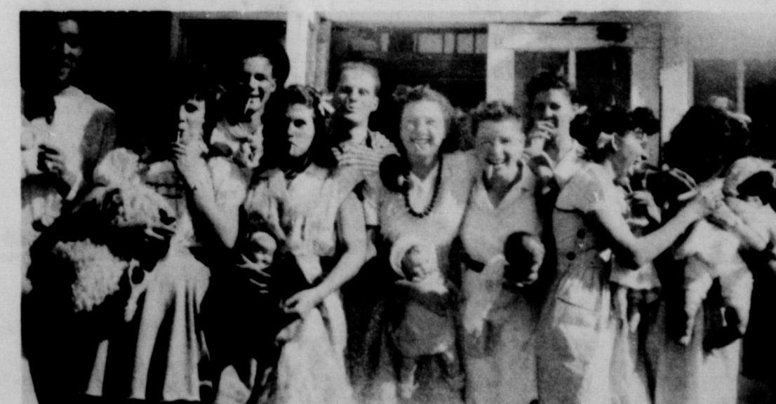
When teenagers dressed a little strange once in a while.