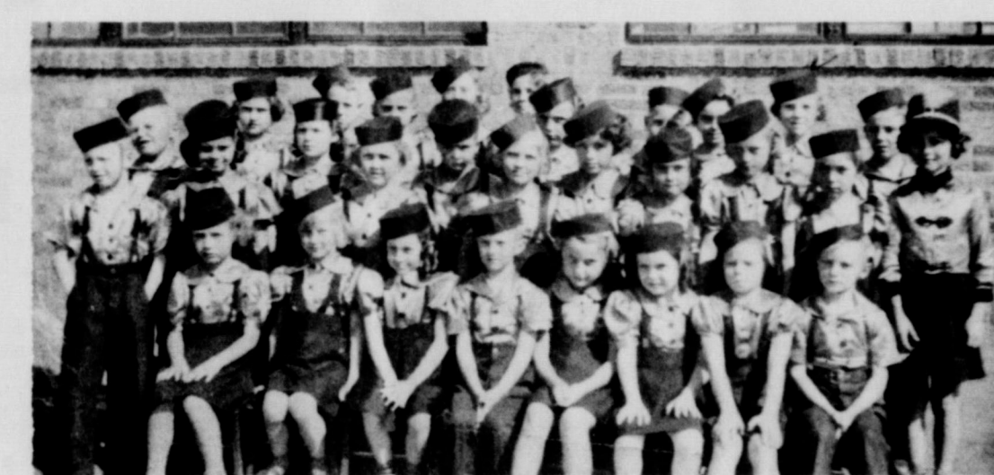
When the 1938 Rhythm Band looked like this.