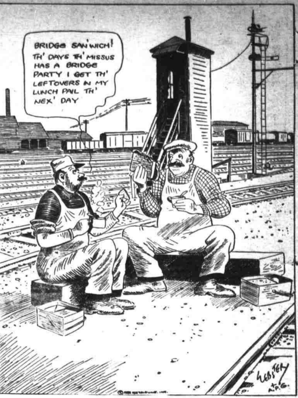
BRIDGE SANDWICH! TH' DAYS TH' MISSUS HAS A BRIDGE PARTY I GET TH' LEFTOVERS IN MY LUNCH PAL TH' NEX' DAY