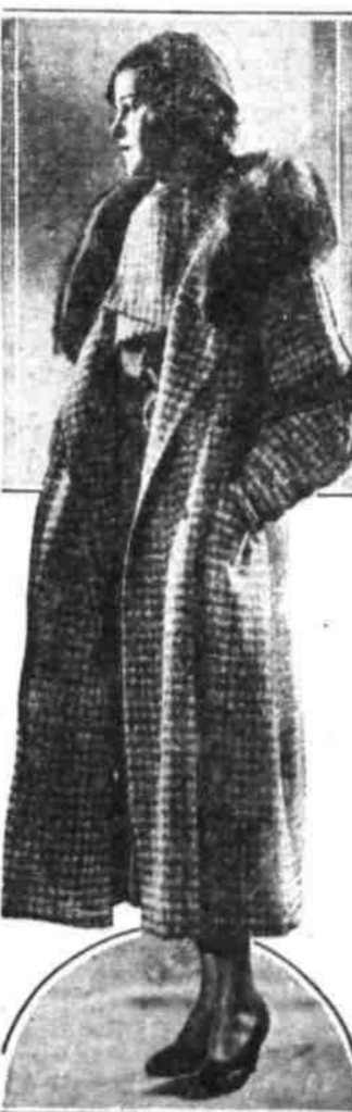
The co-ed can go anywhere in this smart checked brown and beige racoon with an inner scarf permitting it to drape the shoulders in pleasant weather.