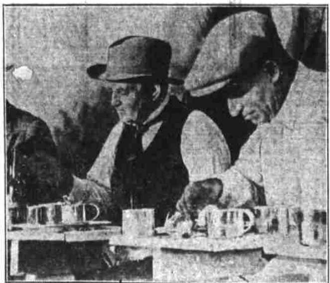
Vice-President John Garner (left) and Will Rogers, actor-humorist, live up to their reputations as rugged southwesterners as they tackle a meal of barbecued goat and Mexican beans...

News Behind The News THE NATIONAL Whirligig