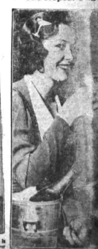
Milliners, anticipating repeal, have created the repeal bob shown here. The wire mesh design in the lady's hair is put there by means of a stencil and vegetable coloring matter.