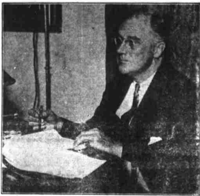
President Roosevelt is shown at his desk in the White House when he addressed the nation on his recovery program. Besides announcing a new policy to control the dollar, the President answered critics of the NRA.