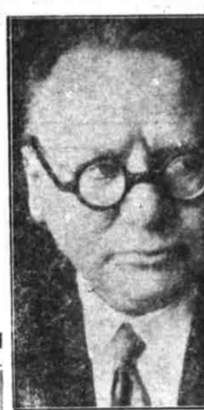
Maxim Litvinoff, commissar for foreign affairs of the Soviet government, will come to Washington soon to confer with President Roosevelt regarding recognition of the Soviet republic by the United States.