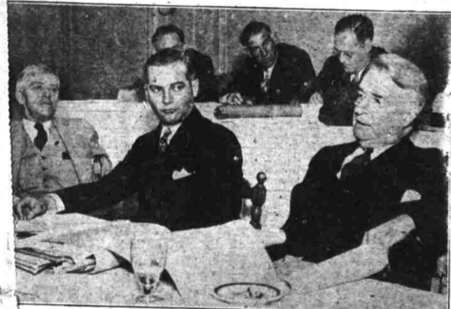
In giving the federal government greater facility in prosecuting the racketeer, kidnaper and extortionist, a subcommittee of the United States District Attorney Dwight Green (center) as a senate sub-committee met in Chicago. At right is Sen. Royal S. Copeland, chairman of the sub-committee, and Louis J. Murphy of Iowa.