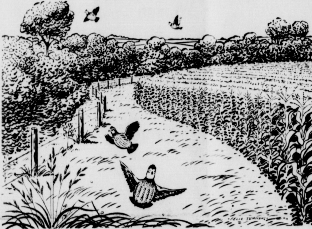
FIELD BORDER STRIP

Now is the time to start thinking of providing winter food and cover for game birds. A strip of Brown top miller, Prose miller, or Red Top cane (avoid using any allotted crop such as milo) around the edge of a field provides excellent food. It would be ideal to have these strips next to a shelterbelt or some similar protective cover. These plantings should be drilled and ought to be 16 to 20 feet wide. Seed the millet at the rate of ten pounds per acre at a one to two inch depth. The cane should be seeded at a rate of about 12 pounds per acre at 1 to 2 1/2 inch depth. Fertilizer should be added at the rate of 30 pounds of actual nitrogen and 40 pounds of actual phosphorous (30-40-0) per acre.