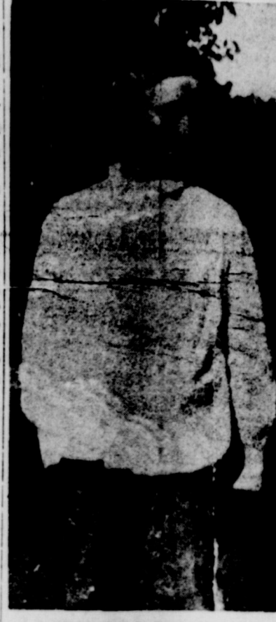
What Is Your Guess?

The fair catalogs for the Wheel-Song services begin each night er Fair will be ready next week at 7:45 and everyone is cordially according to Dick Guynes, secreer Fair will be ready next week tary-manager of the Wheeler Chamber of Commerce.