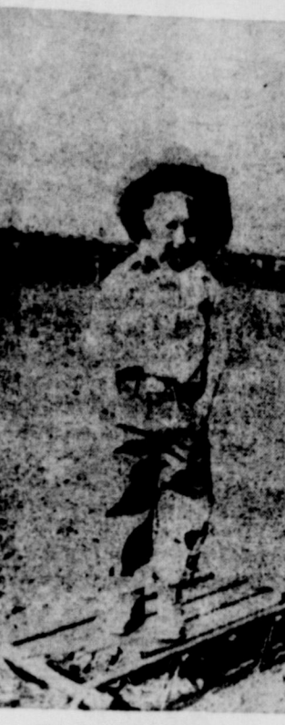
What Is Your Guess?