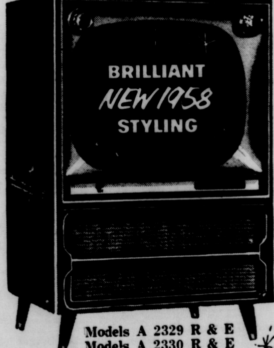
Models A 2329 R & E Models A 2330 R & E