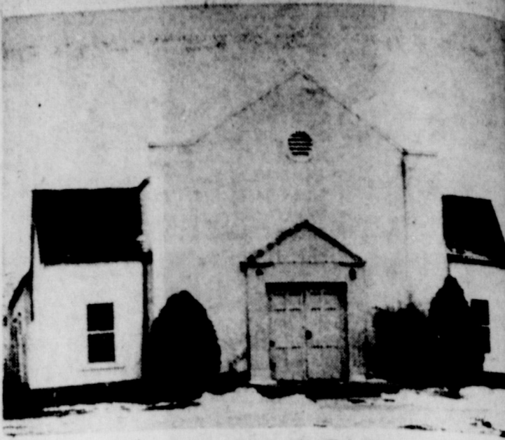
Wheeler Church Of Christ

It is truly more blessed to give than to receive when we give to others those things which we need for ourselves. For it is in giving to others that the things of greatest value become our own.