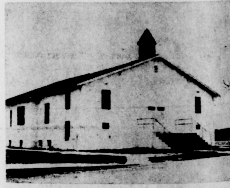
Mobeetie First Baptist Church