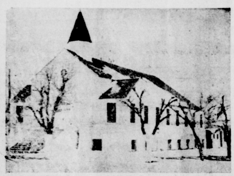
Mobaetie First Methodist Church