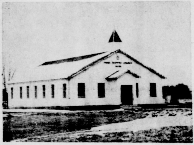
Kelton First Baptist Church