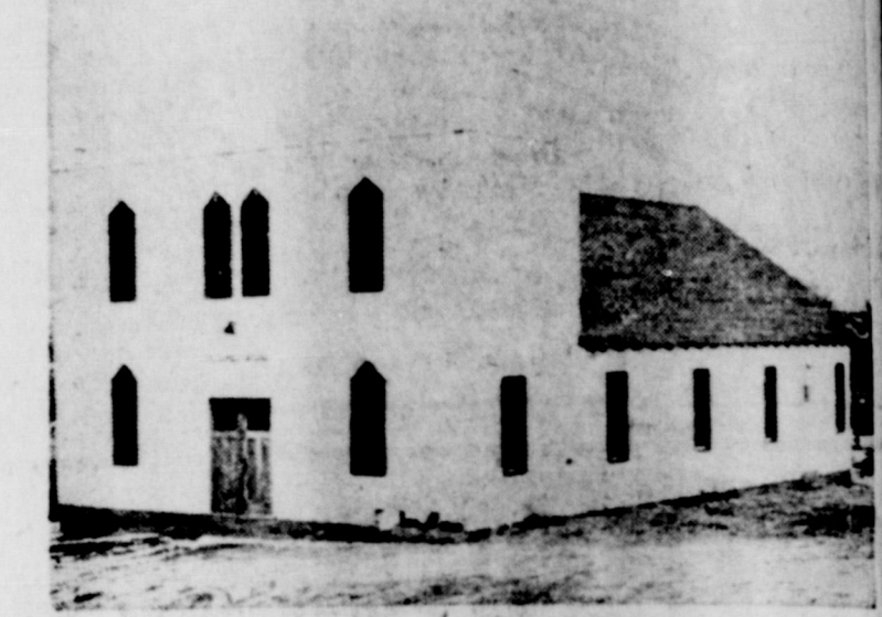
Wheeler Assembly Of God