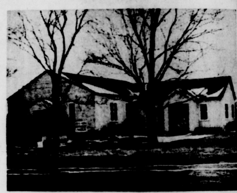
Kelton Methodist Church