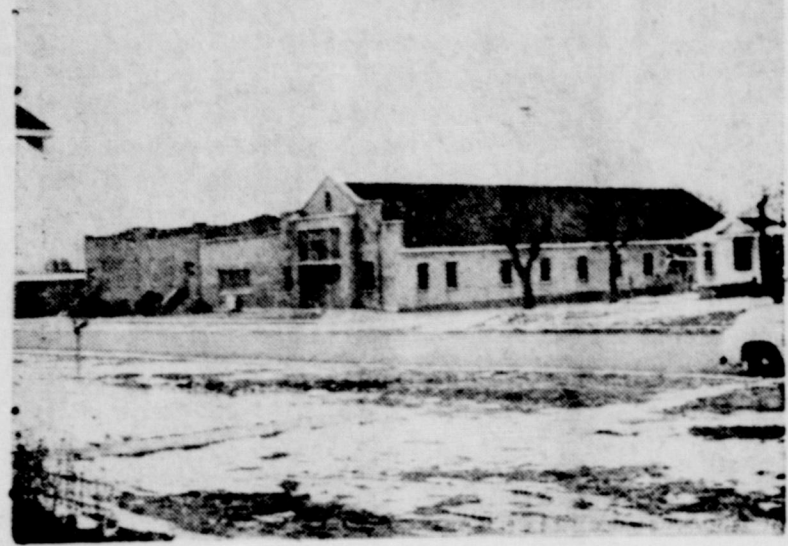
Wheeler First Baptist Church