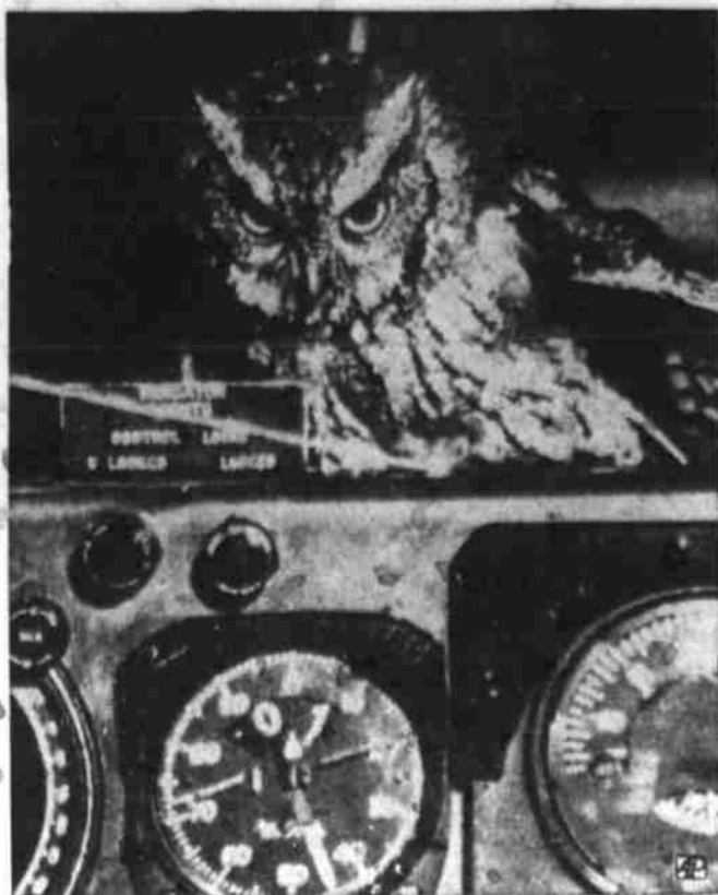
Owl Hitch-Hikes To Texas

MUNSAN, Korea — The U. S. Eighth Army has named the proposed exchange of sick and wounded prisoners of war "Operation Little Switch." The overall exchange of prisoners will be known as "Operation Big Switch" if it takes place.