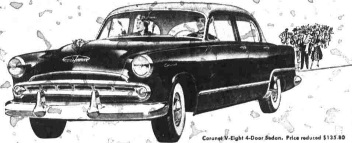
Coronet V-Eight 4-Door Sedan. Price reduced $135.80