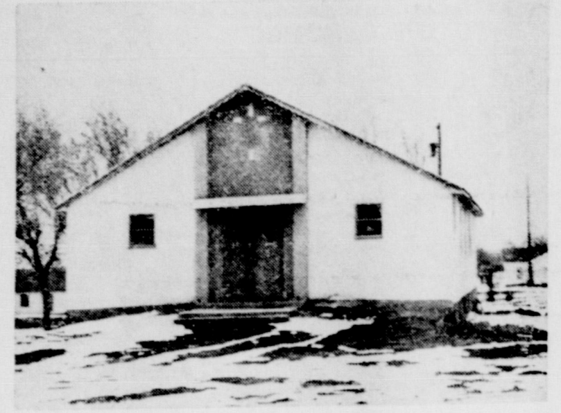
Wheeler Nazarene Church