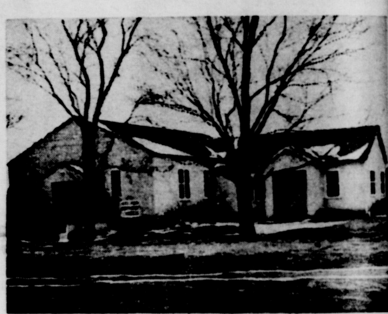
Kelton Methodist Church