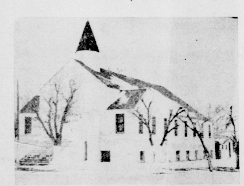
Mobeetie First Methodist Church