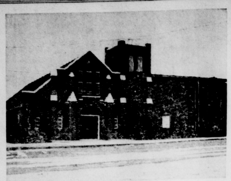
Wheeler First Methodist Church