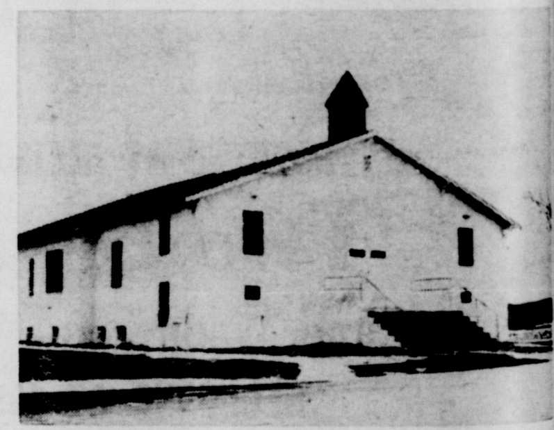
Mobeetie First Baptist Church