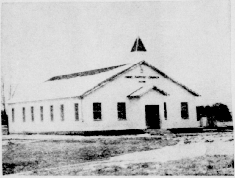
Kelton First Baptist Church